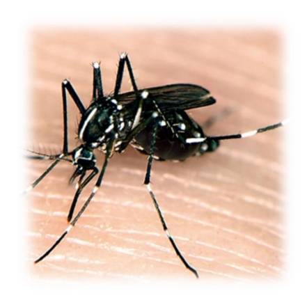
ASIAN TIGER MOSQUITO (Aedes albopictus)

Easy steps to reduce mosquitoes and protect yourself from bites